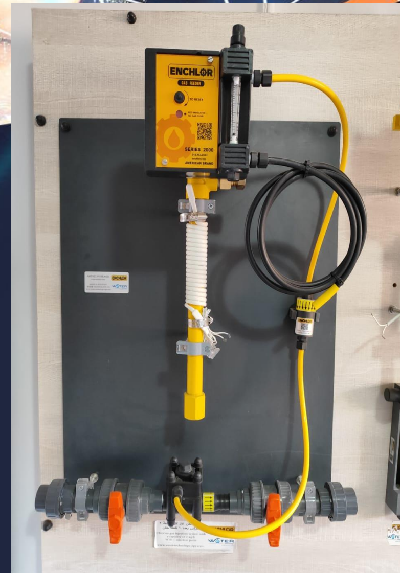
Chlorine injection system with a capacity of 2 kg/h for one injection point