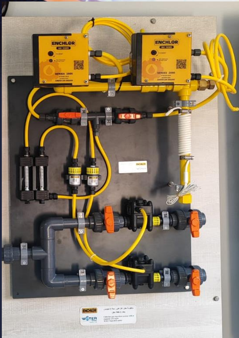
Chlorine injection system with a capacity of 5 kg/h for 2 injection points